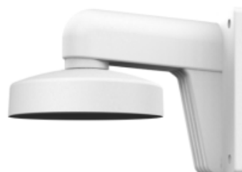
Indoor wall mount DS-1273ZJ-130