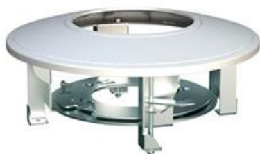
Indoor in-ceiling mount DS-1227ZJ