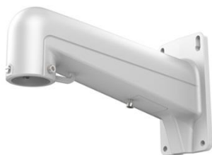
DS-1602ZJ Long-arm Wall Mount Bracket