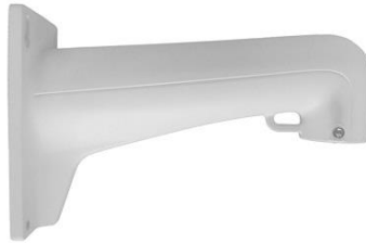
DS-1602ZJ Long-arm Wall Mount Bracket