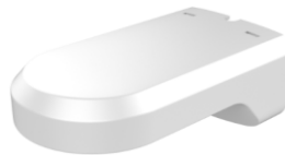
DS-1294ZJ Wall Mount