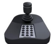
DS-1005KI USB Joy-stick