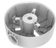
DS-1280ZJ-PT3 Junction box