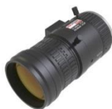
HV1140D-8MPIR 11~40mm DC Iris Lens