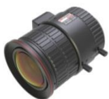
HV3816D-8MPIR 3.8~16mm DC Iris Lens